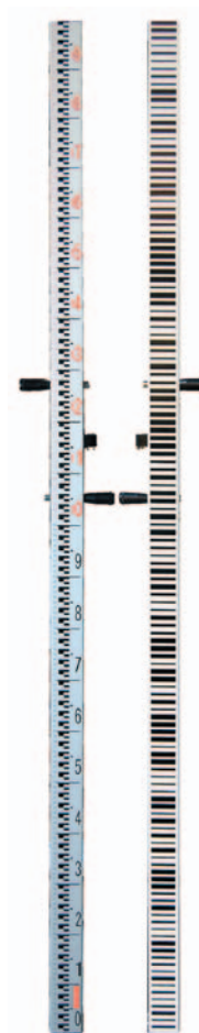
Each instrument comes with 2x 2metre bar coded fiberglass staves. The Di-Lev 20 comes with 2 aluminium bar coded staves.

SINGAPORE SURVEY INSTRUMENTS SERVICES PTE LTD Email : info@horizon.sg Tel : (65) 6288 4622 Fax : (65) 6288 2033