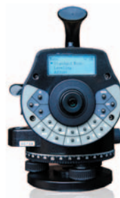
View Finder Side