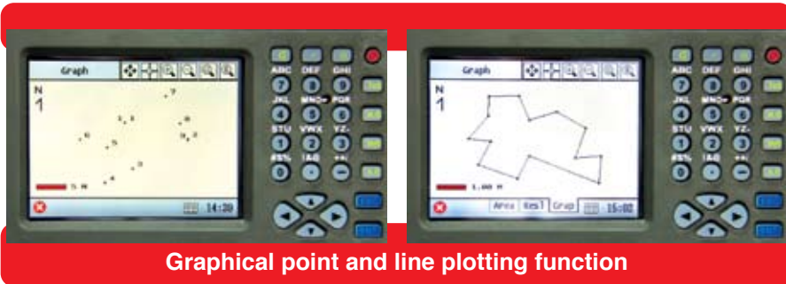
Graphical point and line plotting function