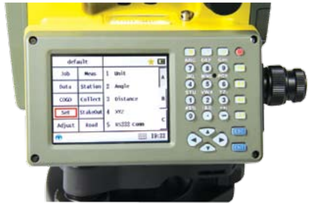
The new H9 LCD color touch screen interface